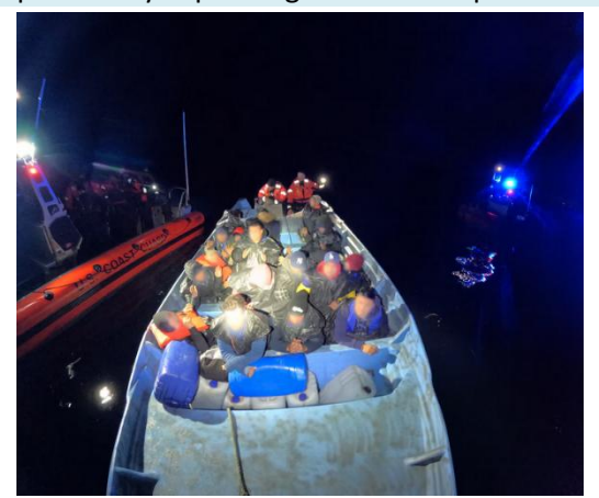
USCG increases operations along southwest border between US and Mexico implementing Presidential EO Emergency Declaration

Revised Policies and Strategies: The President may order DHS to revise policies and strategies to address the perceived emergency, including potentially expanding detention capacities and