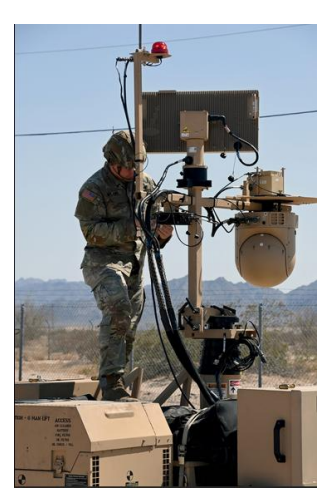
USA Military Police installing ground based operational surveillance system, a multispectral sensor, and persistent surveillance system along Arizona border with Mexico