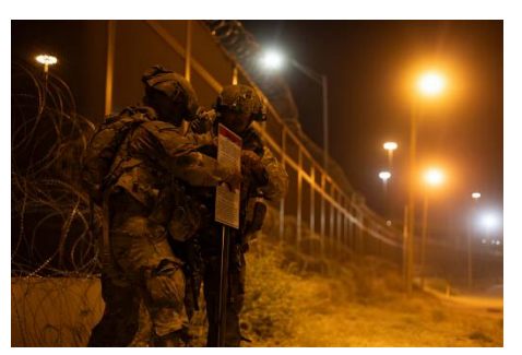
Soldiers assigned to Joint Task Force (JTF) Southern Border marking the El Paso, TX National Defense Area

Enhanced Border Security: An EO can authorize the deployment of additional military personnel and resources to the border, potentially leading to more effective interception of illegal crossings and drug trafficking.