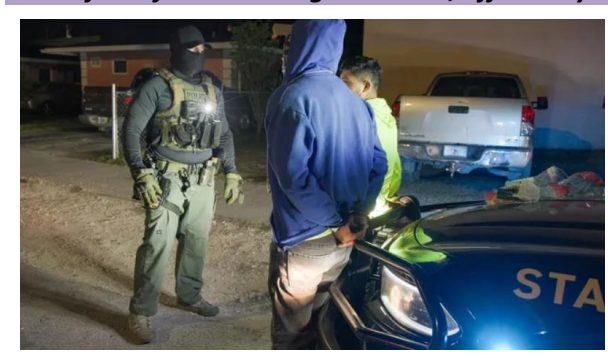
Florida Operation Tidal joint operation with Florida law enforcement and ICE resulting in apprehension of 1,1000 criminal illegal aliens.