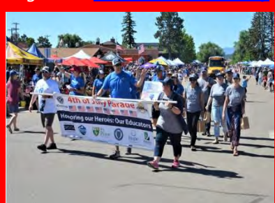
Figure 12023 July 4th Parade

Commerce Kiwanis sponsored July 4<sup>th</sup> Parade. This parade is dubbed the "biggest small-town parade in America." Over 80 entries thrill 20,000+ spectators during the celebration. Please contact Junior Vice